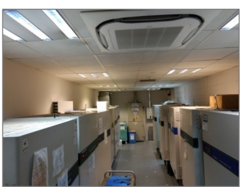
Figure 3. Observed lack of organisation in freezer rooms