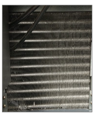
Figure 1. Before and after of defrosting/cleaning freezers.