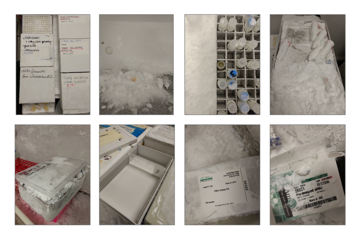
Figure 4. Examples of poor storage practices

trays are currently the main method used to store samples inside the freezer. However bags are also in use, which greatly reduces the space available and also hinders the search of samples.