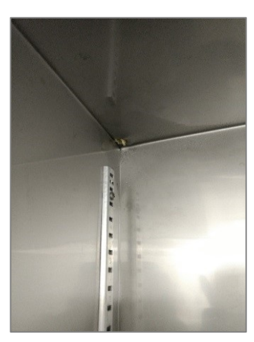
Figure 2. Examples of poor maintenance in freezers